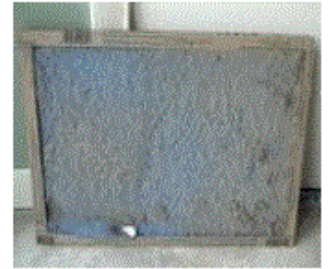
Used -Dusty Furnace Filter